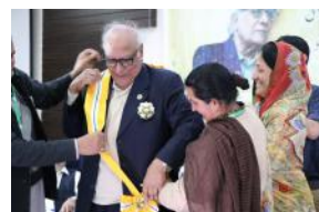
AKRSP AND AKF(PAK) ORGANIZE AN LSO CONVENTION IN GILGIT P.3