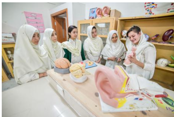
AKES,P students during a group exercise in a lab