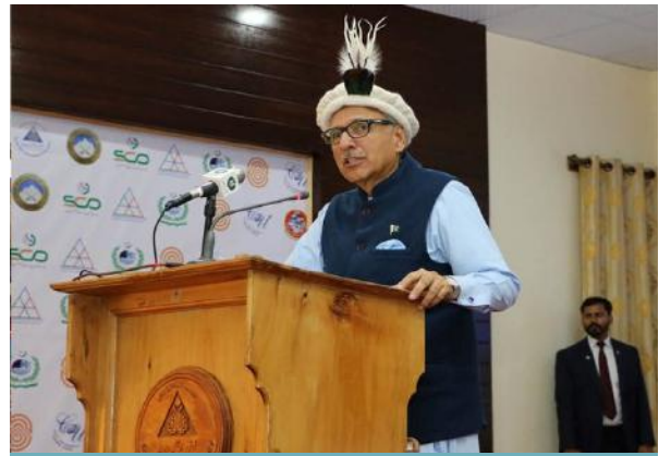
The Hon. President addressing the audience at the conference