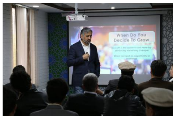
Session on value-investing for AP supported businesses by Arif Habib Group and Silk Bank Investments

In the two years since inception, AP Pakistan has engaged 12,434 entrepreneurs, and provided select startups and existing businesses relevant trainings and business advisory. It has incubated 97 startups and provided financing-readiness services to 41 existing businesses. AP Pakistan has provided direct finance and intermediated external investments for 29 businesses and leveraged its finance to unlock four times its investments for these businesses from business owners and the private sector. It has also facilitated more than PKR 50 million worth of external financing commitments for these businesses. AP Pakistan's support has enabled these businesses to create 172 new jobs and improve 2,350 existing jobs. AP Pakistan supported businesses have experienced an average year on year increase in revenues of around 18.5%. Over the next five to seven years, AP Pakistan intends to engage around 15,000 entrepreneurs, provide training and business advisory to around 900 businesses, and extend financing or intermediate investments to around 300 businesses across Pakistan.