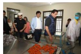
ADVISOR TO PRIME MINISTER APPRECIATES AKDN ON A VISIT TO PROJECT SITES P.4