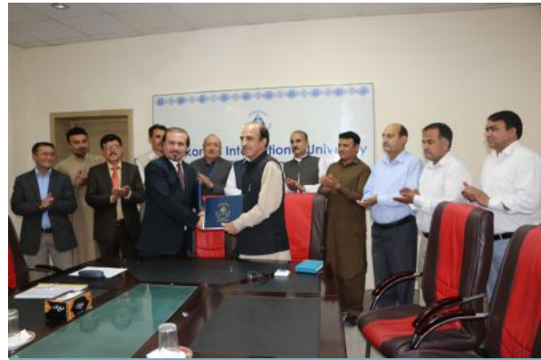
Exchange of MOUs between AKAH,P and KIU at the signing ceremony

adaptation, will make us achieve the goals of reducing disaster vulnerability and improve built environment. This partnership with KIU, the leading academic institution in Gilgit-Baltistan, will assist our teams in conducting research studies that will contribute for innovation as well as value addition to the existing indigenous knowledge, for disaster management and building safer habitats.” In the past AKAH,P and KIU have worked on the assessment of selected glaciers and the development of skilled craftsmanship in Gilgit-Baltistan through joint programs.