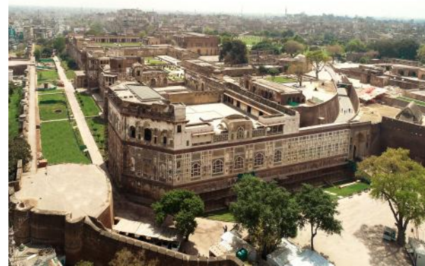
Restored western facade of the Picture Wall of Lahore Fort