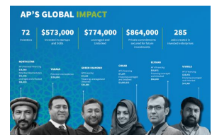
ACCELERATE PROSPERITY: AKDN'S ENTERPRISE GROWTH ACCELERATOR P.5