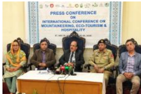
PRESIDENT OF PAKISTAN SPEAKS AT A CONFERENCE ORGANIZED BY SERENA HOTELS P.2