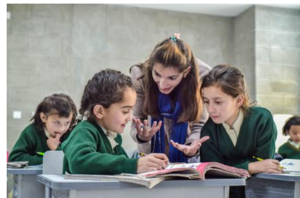
A teacher at AKS Murtaza Abad interacting with students