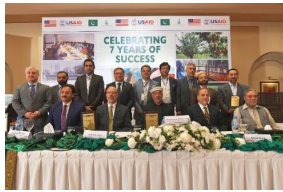
ACHIEVEMENTS OF SDP LAUDED AT CLOSING CEREMONY P.2