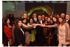
SERENA HOTEL WINS EMPLOYER OF CHOICE FOR GENDER BALANCE AWARD P.4