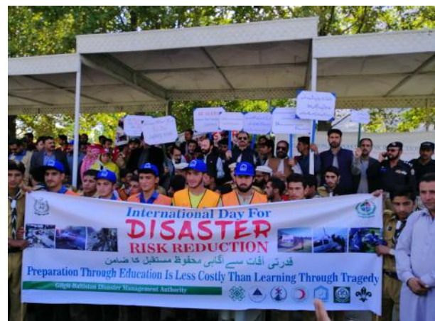
Representatives of government institutions, disaster management authorities and students holding play cards to highlight importance of DRR day

8 October 2018: The high frequency of natural disasters in Pakistan, particularly in the mountainous north, has displaced thousands of people, affected community livelihoods, and destroyed public and private infrastructure resulting in massive economic losses. To stress the importance of Disaster Risk Reduction (DRR), the Aga Khan Agency for Habitat, Pakistan (AKAH,P) celebrated DRR Week across Pakistan from 8th to 13th October 2018. The celebrations were aligned with Pakistan's National Disaster Awareness Day celebrated on 8th October, and the International Day for Disaster Reduction celebrated worldwide on 13th October.