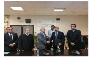
AKF(PAK) AND MINISTRY OF CLIMATE CHANGE SIGN MOU P.5