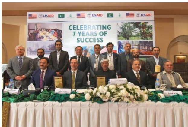
Officials from the Government of Gilgit-Baltistan, along with representatives from USAID and AKDN leadership, came together to celebrate the completion of SDP

The project also had an important impact on government policy: AKF, AKRSP, and government officials worked together to take lessons from SDP and apply them to Gilgit-Baltistan's first-ever Agriculture and Livestock policies. Furthermore, the water management model pioneered under SDP led to the formulation of a Water Act and business plan for the region.