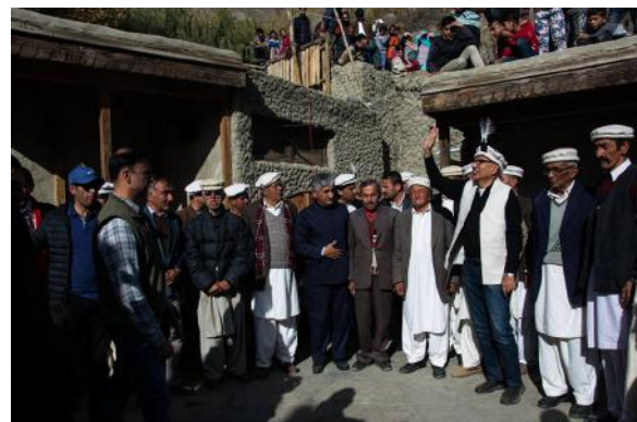
The Honorable President amongst community members during his visit

Community members, whilst interacting with the President, appreciated the efforts of AKCS-P and the role the Aga Khan Development Network has played in empowering the women of surrounding communities by engaging them in economic activities. The President was gifted various publications of the Aga Khan Trust for Culture and a locally made sitar (musical instrument). In his comments in the Altit Fort Visitors book, he wrote: "I enjoyed visiting the Altit Fort and am very impressed by the fact that the surroundings and houses have been restored so that our heritage is taken forward to next generations. Very impressed at the role of women in all activities. It is a pleasure to see a consciousness to preserve heritage and though I am concerned regarding development of tourism, I am sure it will be done in a responsible manner."