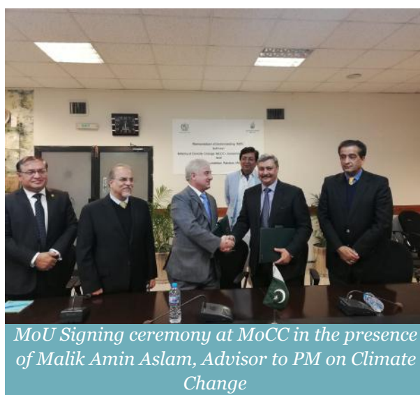
MoU Signing ceremony at MoCC in the presence of Malik Amin Aslam, Advisor to PM on Climate Change